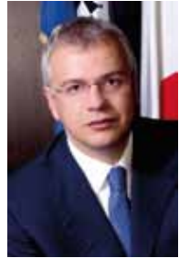
FRANCESCO TALARICO President of the Regional Council

Calabria as protagonist of its destiny, in the National and European context.